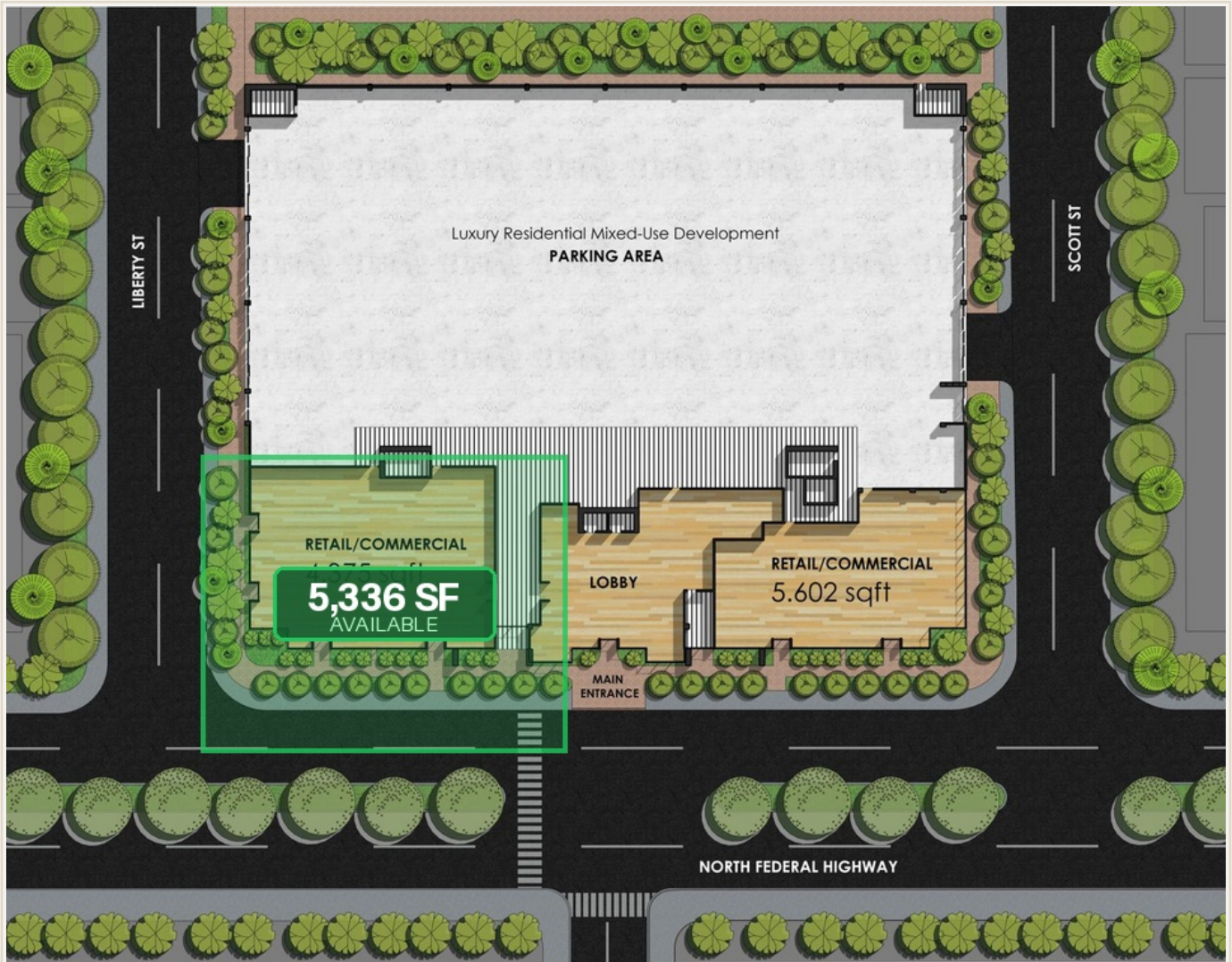
Ground Floor — Available Retail: 5,336 SF (SW Corner) | North Federal Highway Frontage