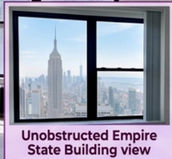
Unobstructed Empire State Building view

BRIGHT, RENOVATED LOFT SPACES IN MIDTOWN SOUTH