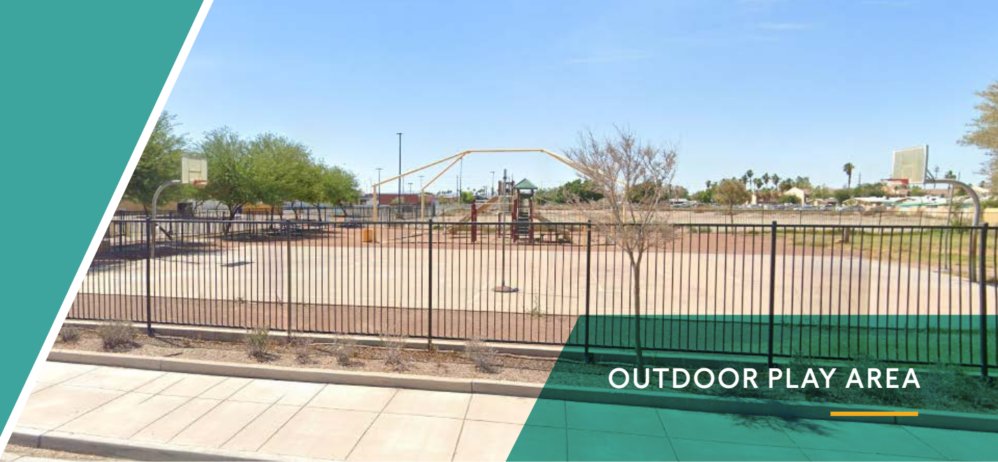
OUTDOOR PLAY AREA