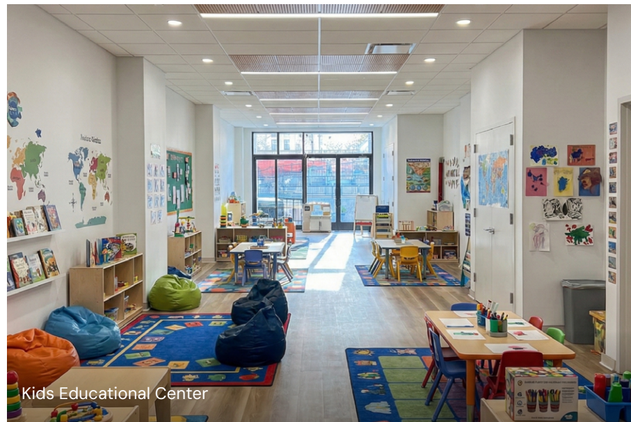
Kids Educational Center