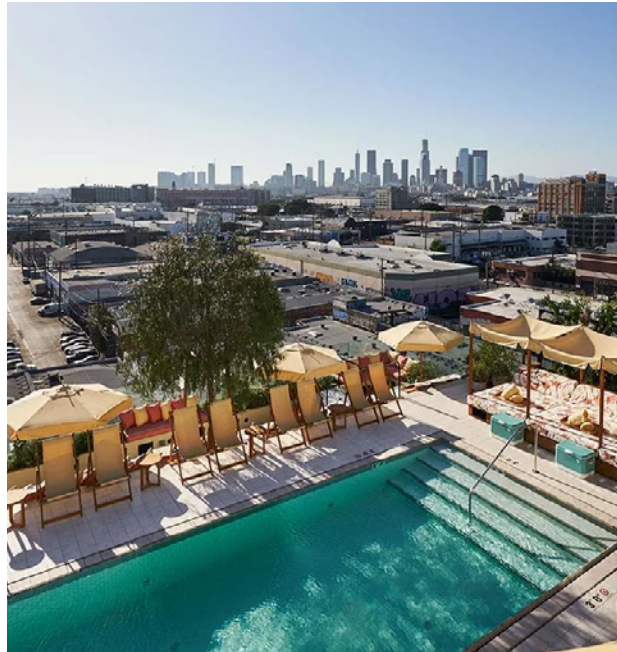
Soho Warehouse along S Santa Fe Ave.