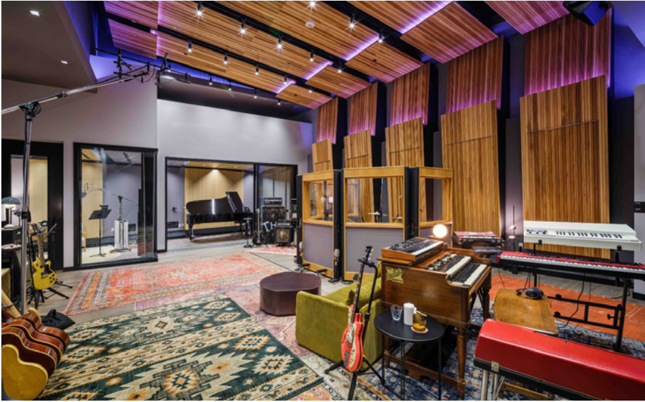
Spotify at AT MATEO,.