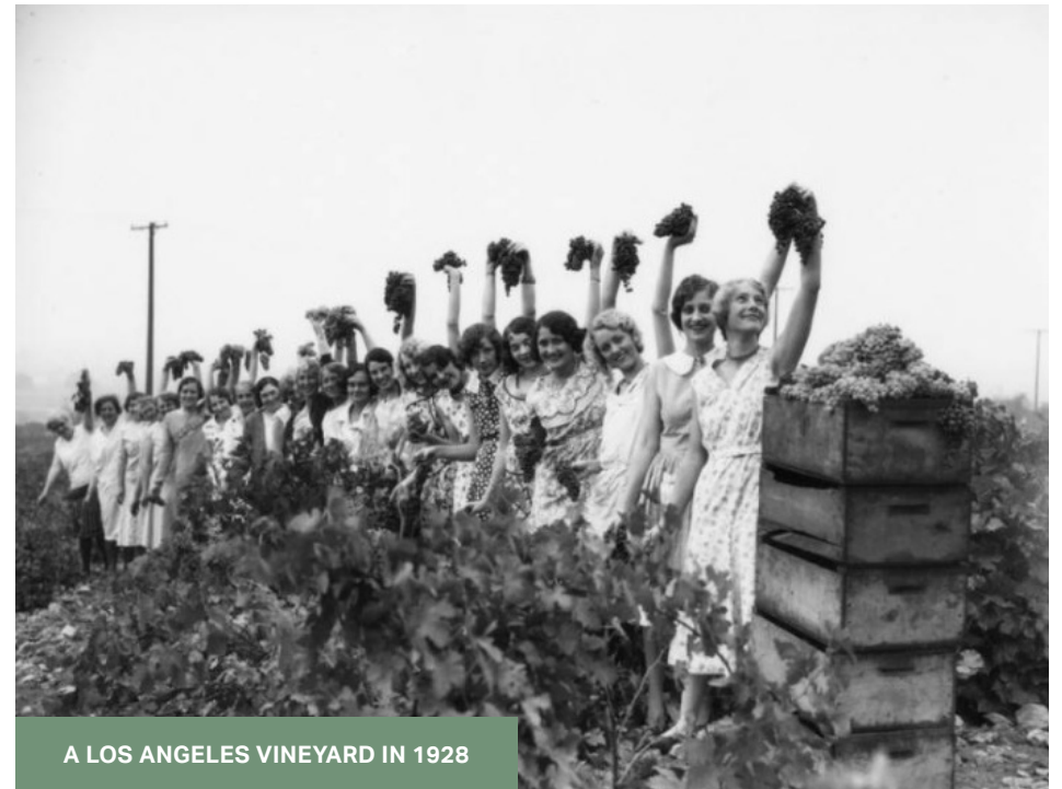
A LOS ANGELES VINEYARD IN 1928

By the 1970s, much of the area's industrial vigor had moved away. Warehouses and factories were progressively activated by artists who needed a place to live, create art, engage with other artists, and establish community. The 1981 implementation of the City's Artist-in-Residence program legalized the residential use of industrial buildings, which ushered in a broader wave of residential conversions that characterize the neighborhood to this day.