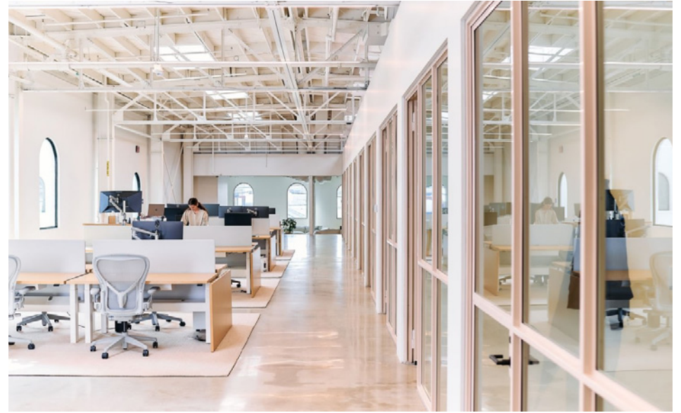
Venture capital firm Greycroft Partners' office along Traction Ave.