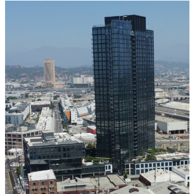
New residential tower at 525 S Santa Fe Ave.