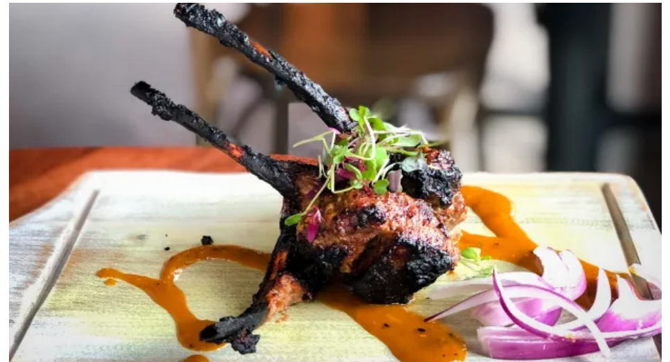
Khan Saab Desi Craft Kitchen - Michelin Bib Gourmand recipient