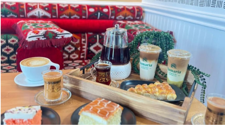
Qamaria Yemeni Coffee Co.

Pinnacle at Fullerton's ground floor tenants include Kosha 5 Yoga, Tennis Factory, Qamaria Coffee and Khan Saab