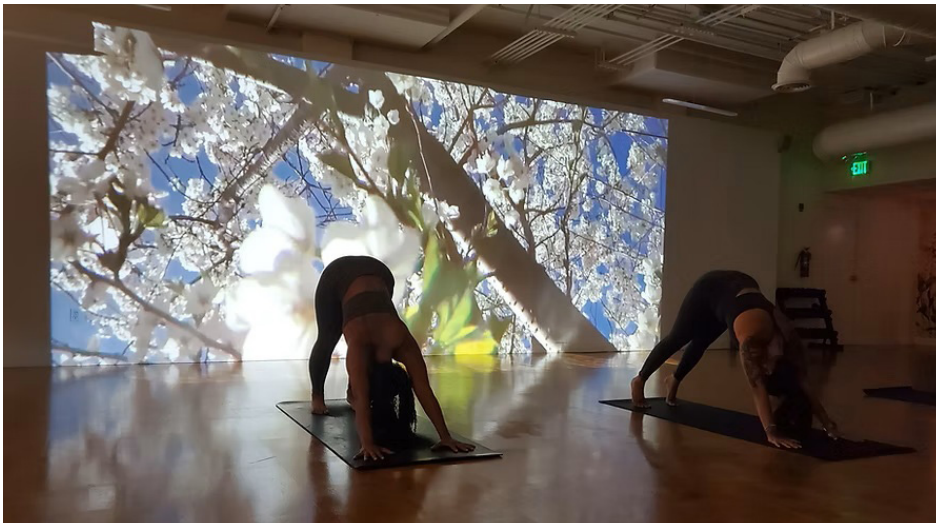
Kosha 5 Yoga Studio