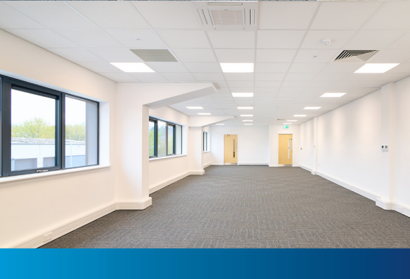
UNIT 9 FITTED OFFICE