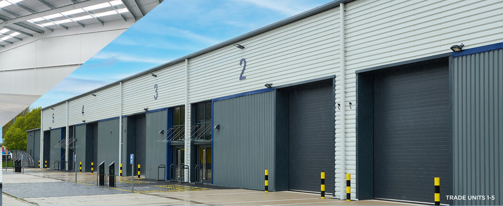
TRADE UNITS 1-5