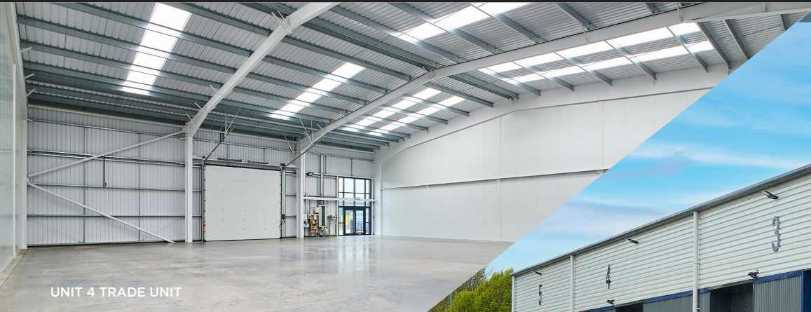
UNIT 4 TRADE UNIT