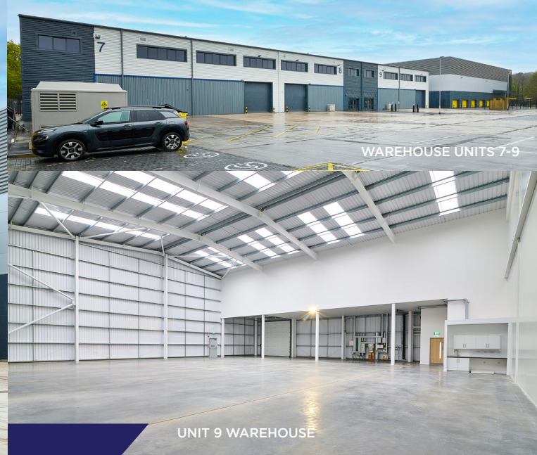
WAREHOUSE UNITS 7-9