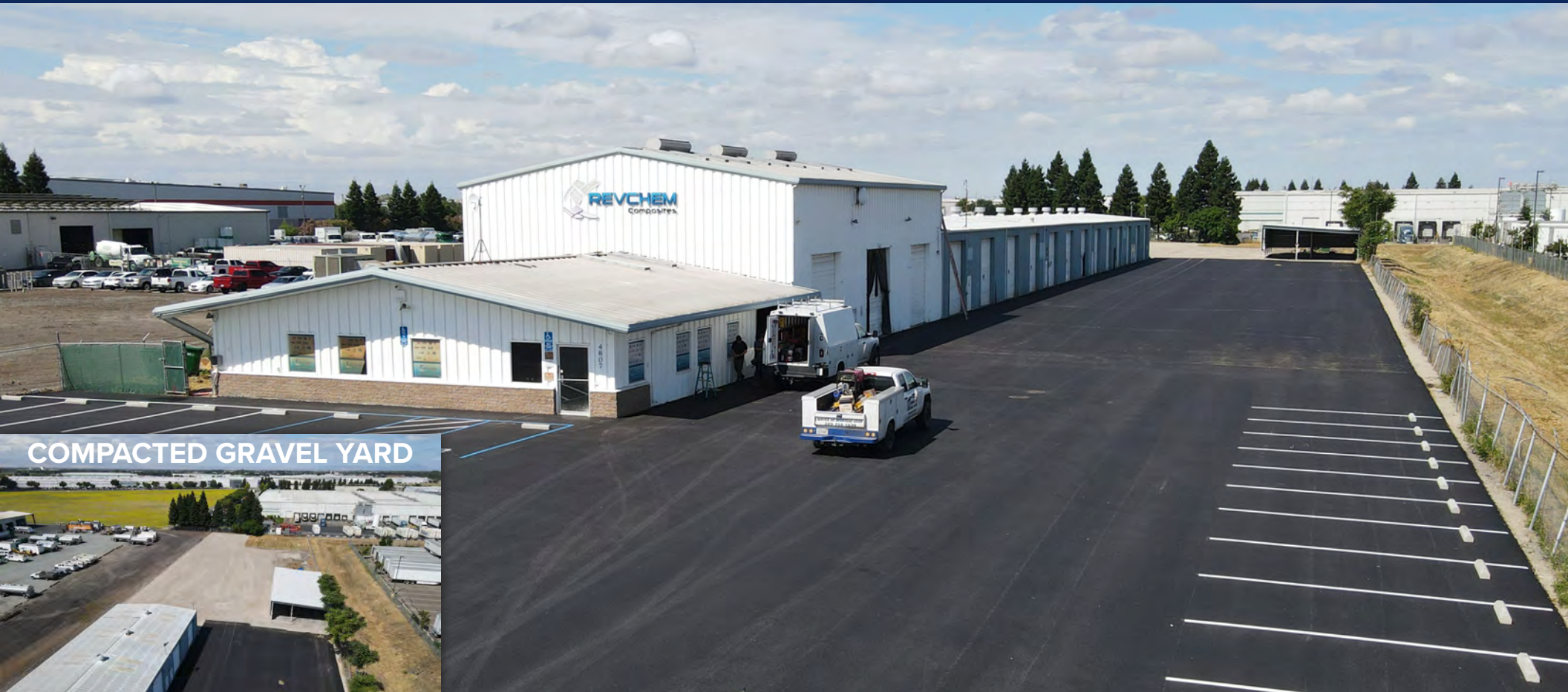
COMPACTED GRAVEL YARD

±22,750 Sq. Ft. Sales/Service/Transportation/Contractors Yard on ±2.91 Acres