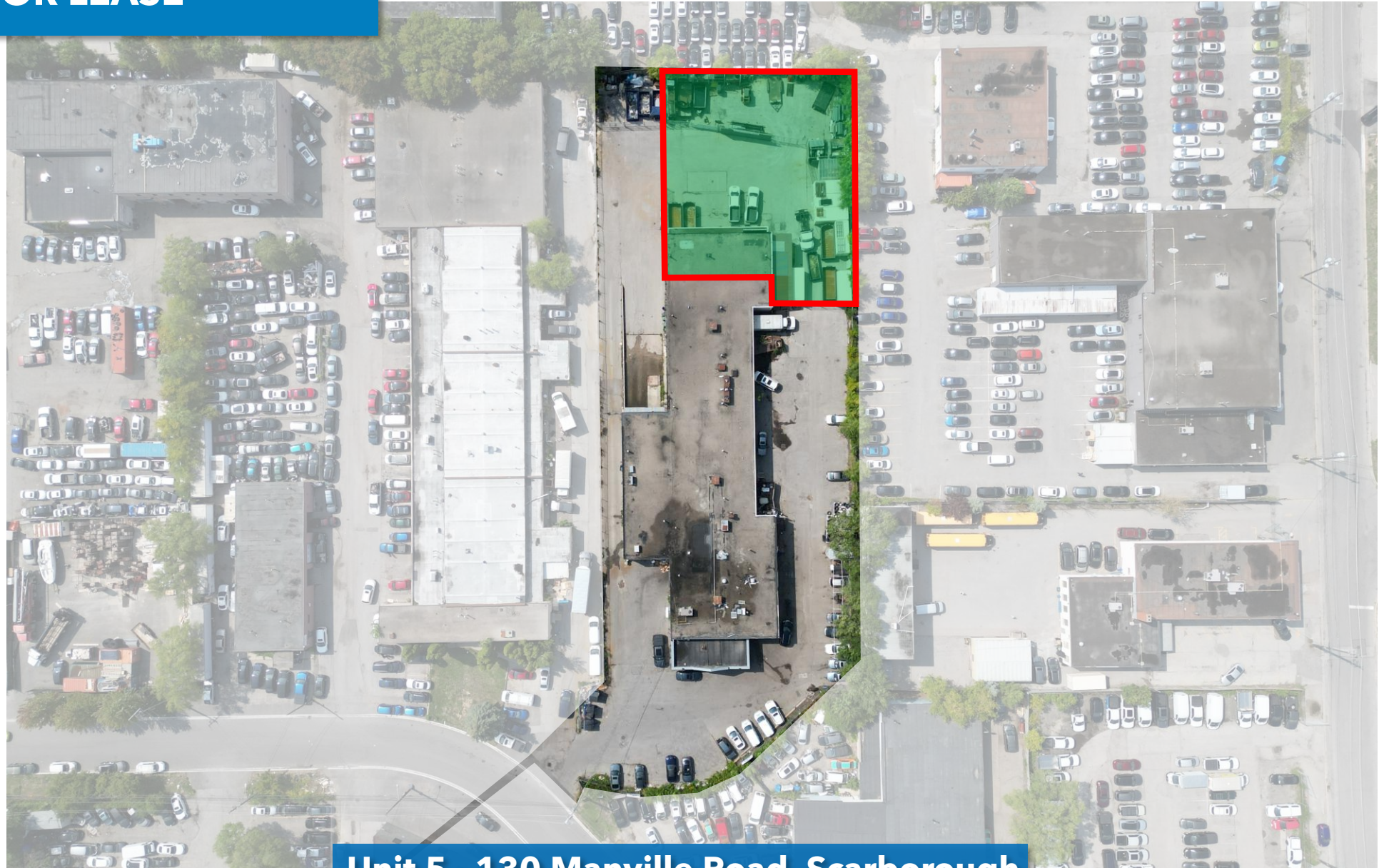
Unit 5 - 130 Manville Road, Scarborough