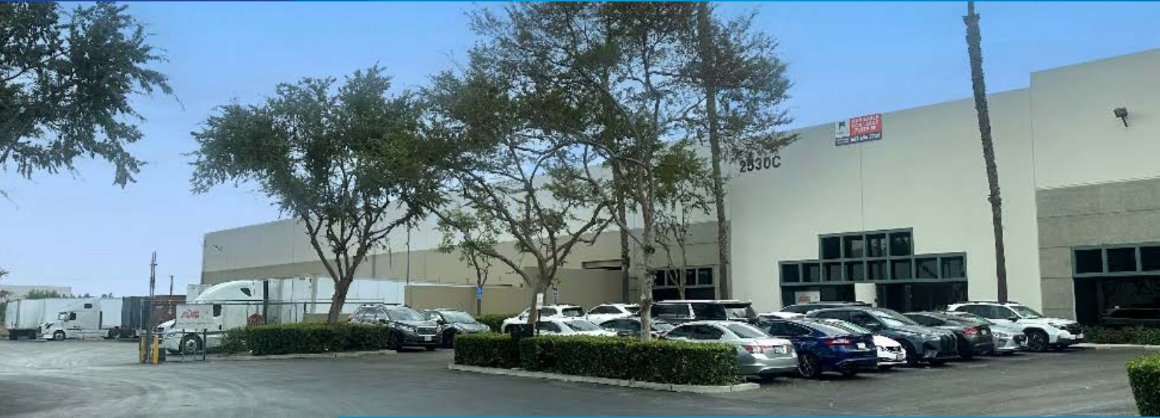
Building 8: 2530 E. Lindsay Privado, Unit C, Ontario, CA