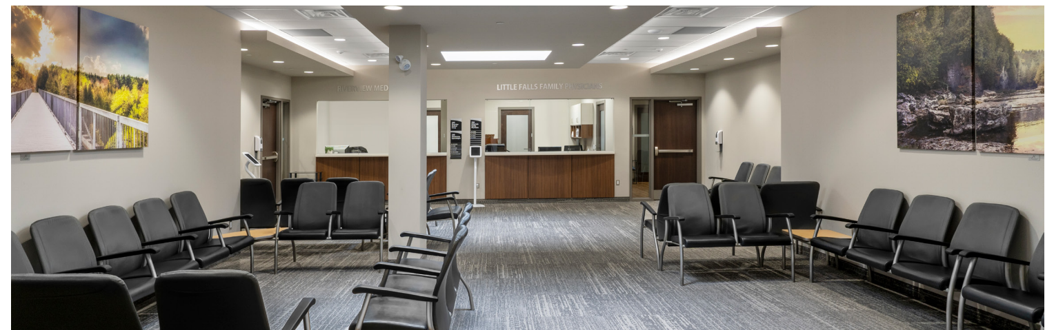
Sample Photo of Finishings