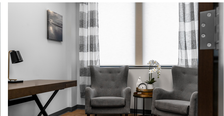
Sample Photo of Finishings