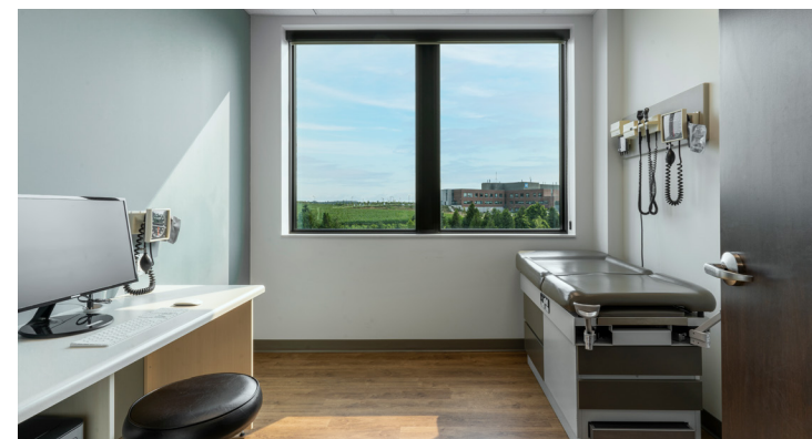
Sample Photo of Finishings