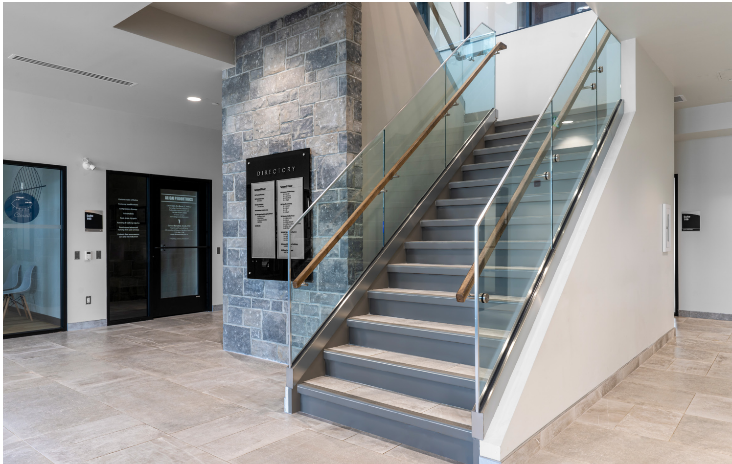
Sample Photo of Finishings