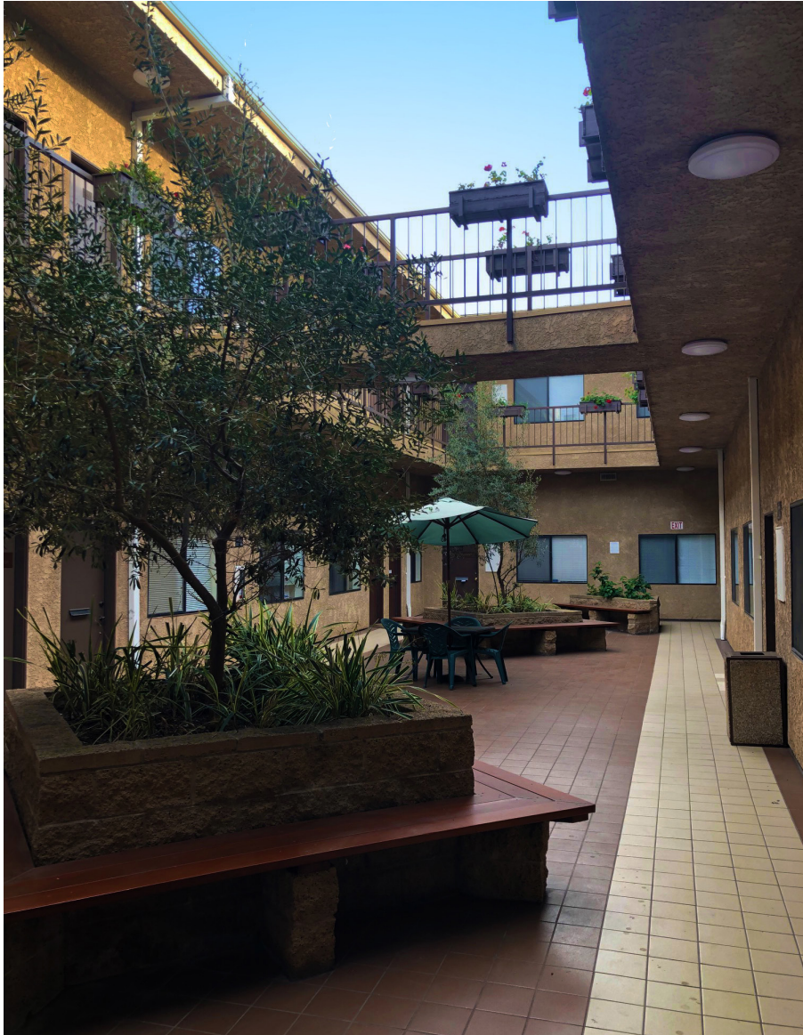
COURTYARD, GROUND FLOOR