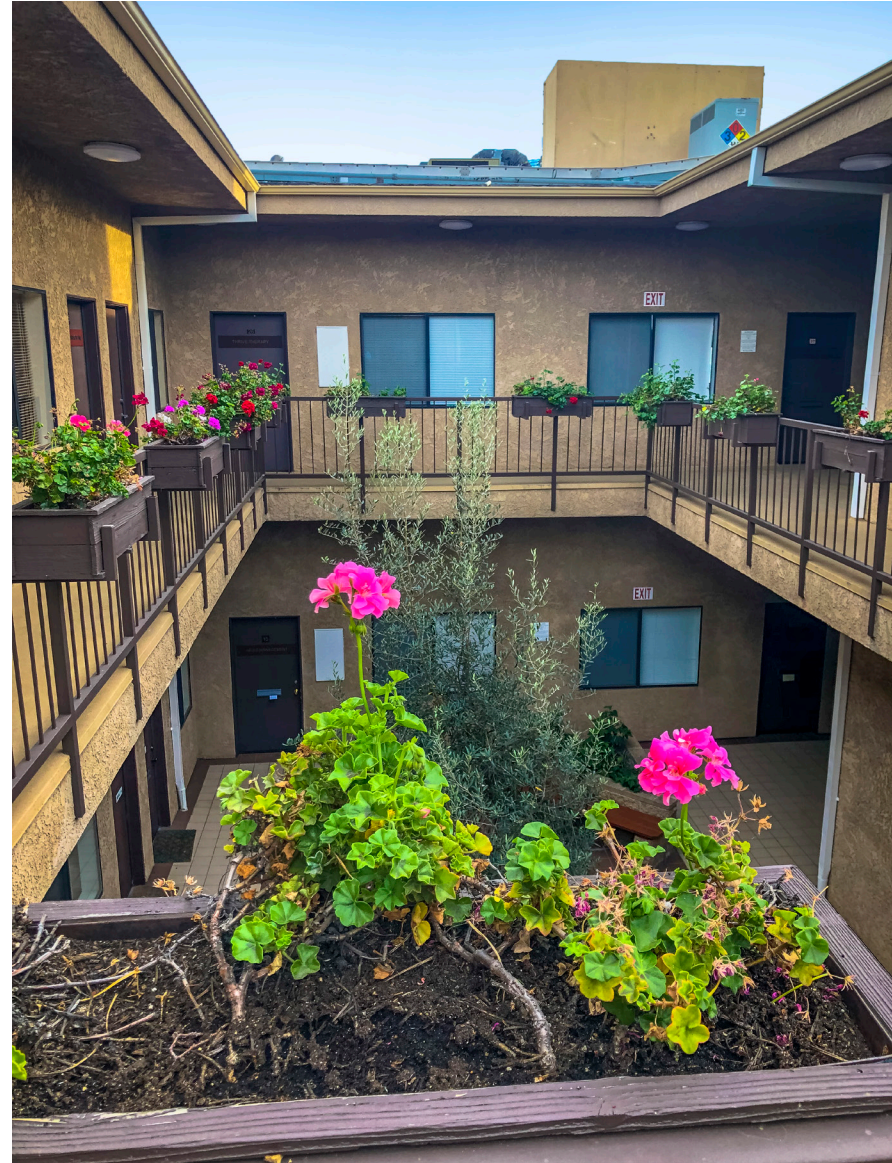
COURTYARD, SECOND FLOOR