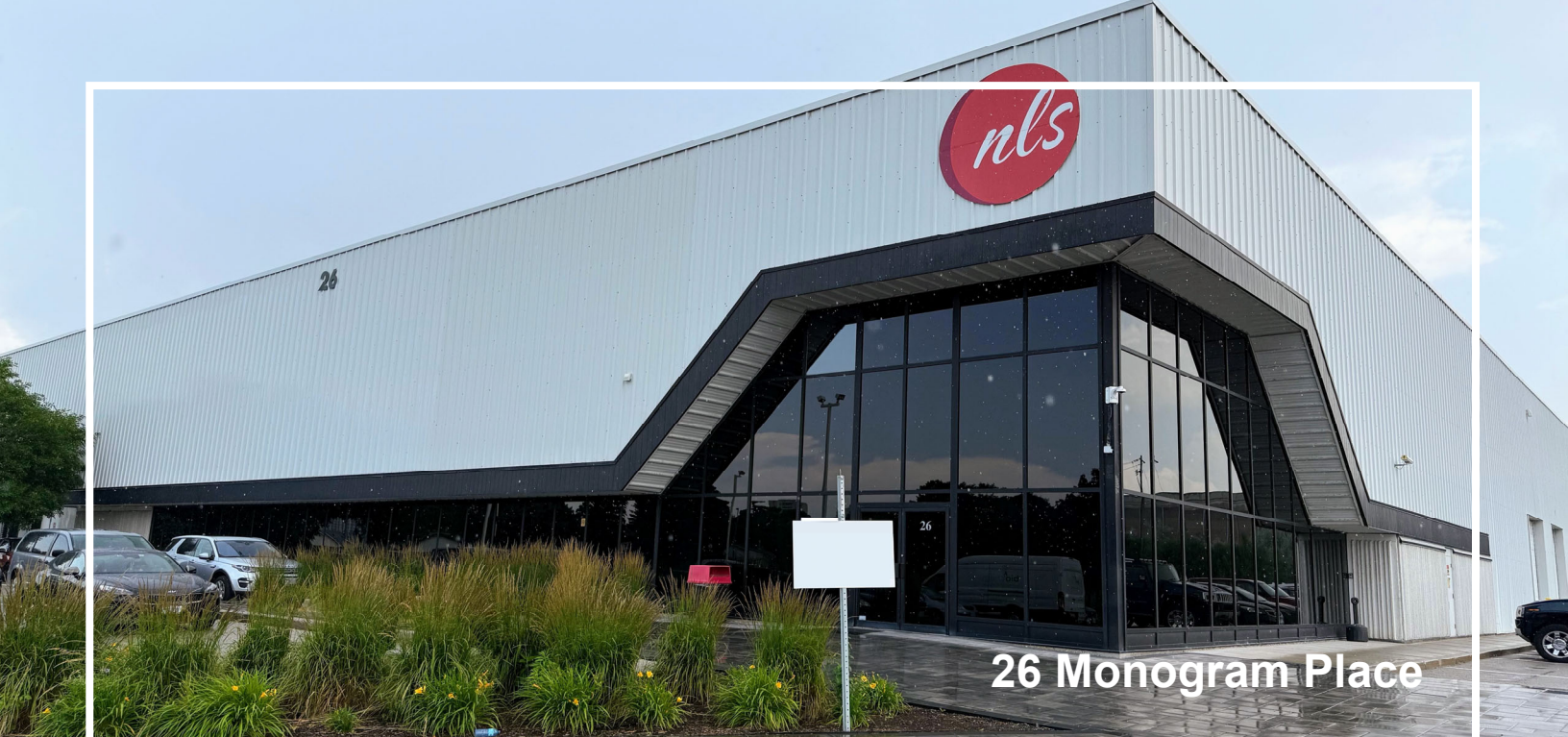
26 Monogram Place