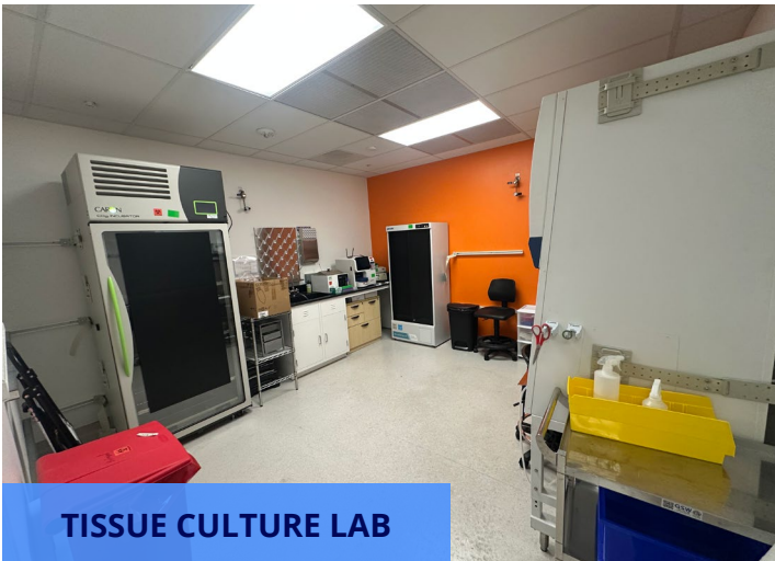
TISSUE CULTURE LAB