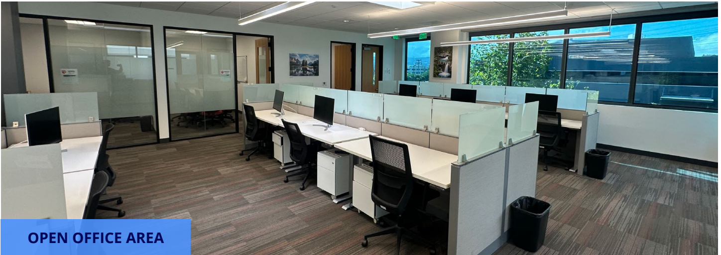
OPEN OFFICE AREA