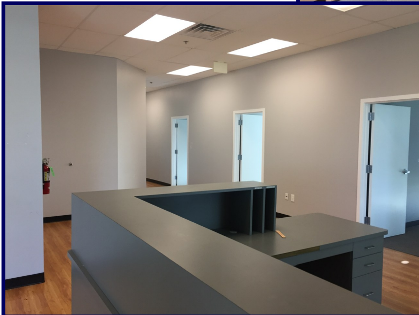
Entry to Exam Rooms

The information provided herein has been given to us by sources we deem to be reliable. We have no reason to doubt its accuracy, but we do not guarantee it. All information should be verified before lease or purchase.