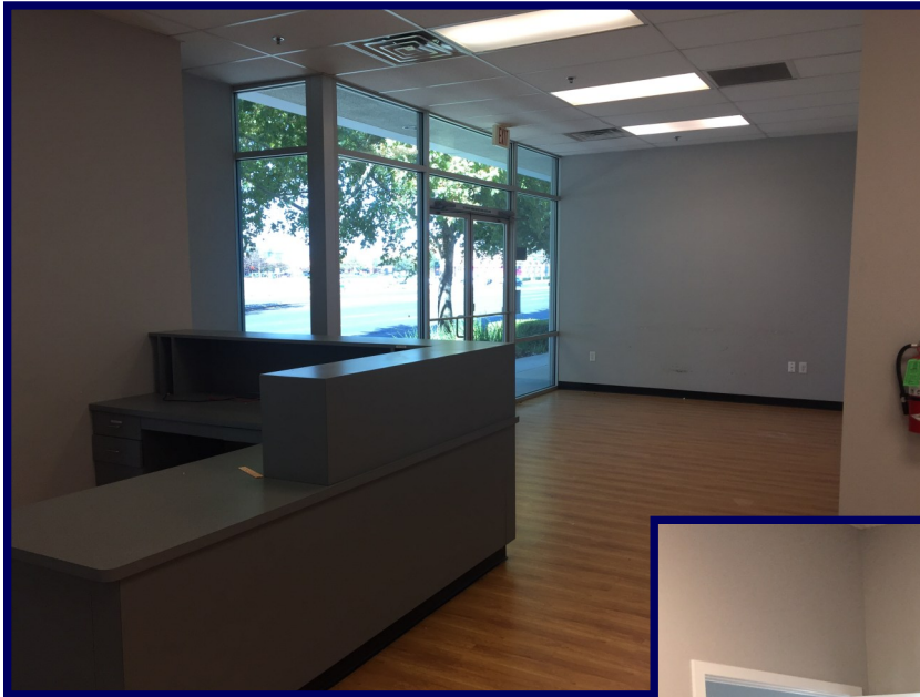
Reception and Waiting Area

Natomas Crossing Business Center 4150 Truxel Road, Suite C North Natomas