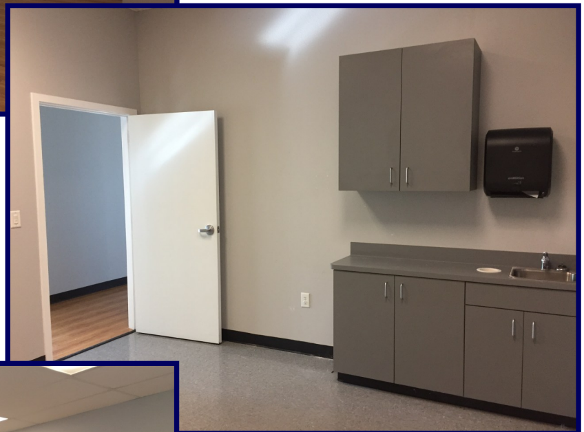
Typical Exam Room