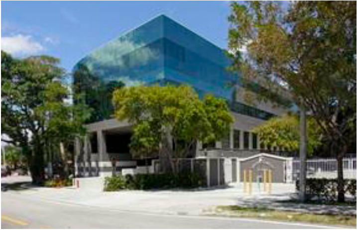
* BUILDING PARKING ENTRANCES

2937 SW 27th Avenue | Coconut Grove, FL 33133