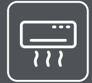
Ceiling Mounted Air Conditioning