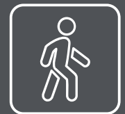
Walking Distance to Shopping Park