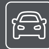
40 Car Parking Spaces