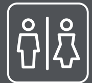
Kitchen & WC Facilities