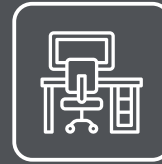
Open Plan Space