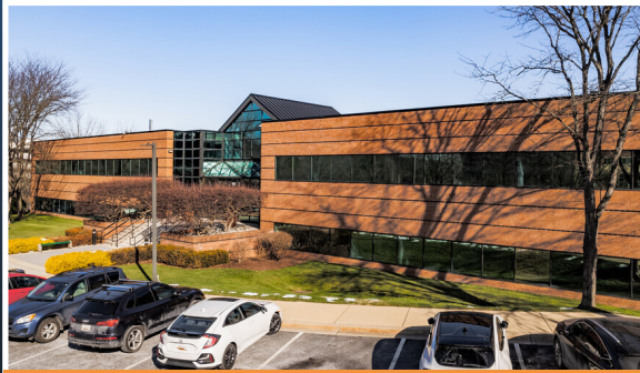
401 Professional Drive

401 Professional Drive is ideally situated in Gaithersburg's established lab and innovation corridor with immediate access to I-270 via the West Watkins Mill Road interchange (Exit 12). Located near NIST and surrounded by a strong life science cluster, the property is also close to major retail and dining amenities along Route 355. Its central Montgomery County location provides convenient connectivity to Rockville, Bethesda, Washington, D.C., and the broader I-270 corridor.