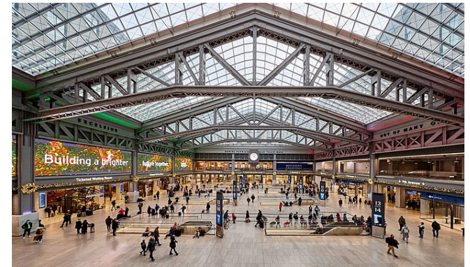
PENN STATION MOYNIHAN HALL