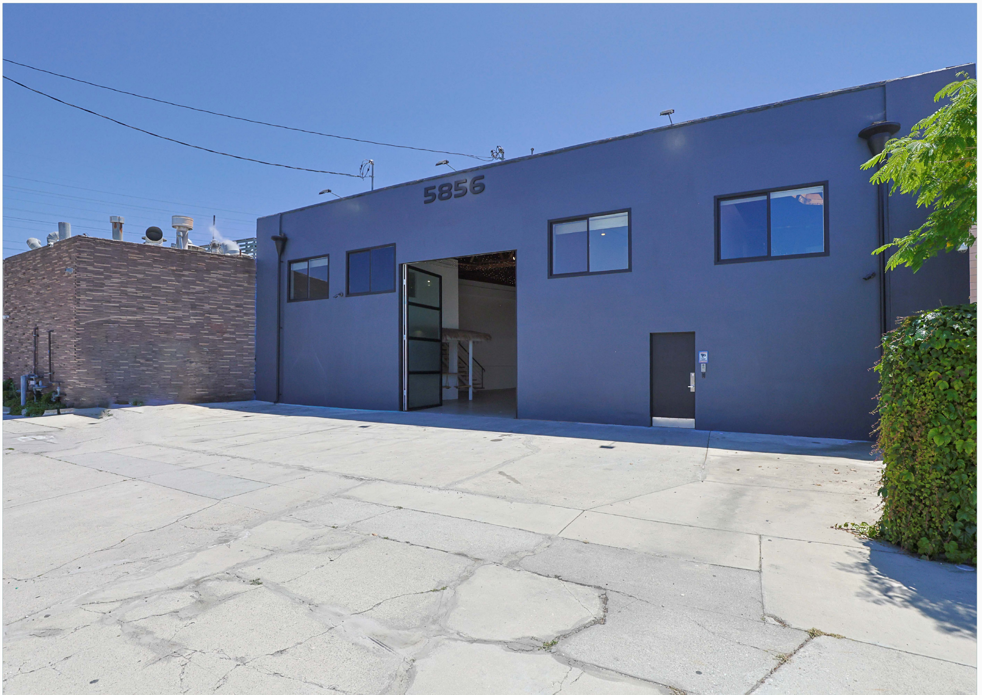
5856 ADAMS BLVD. — CULVER CITY