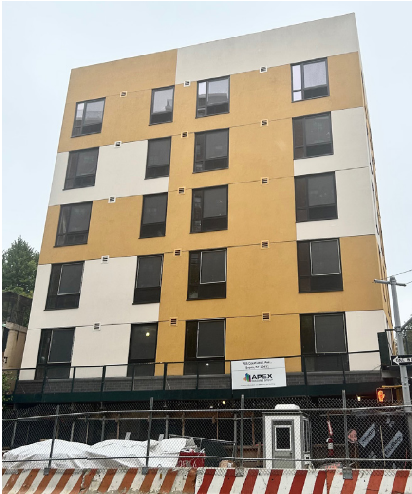
OCTOBER, 2025 CONSTRUCTION IMAGE