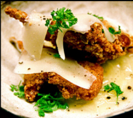
STATE BIRD PROVISIONS