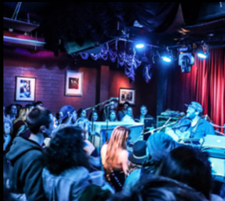
BOOM BOOM ROOM