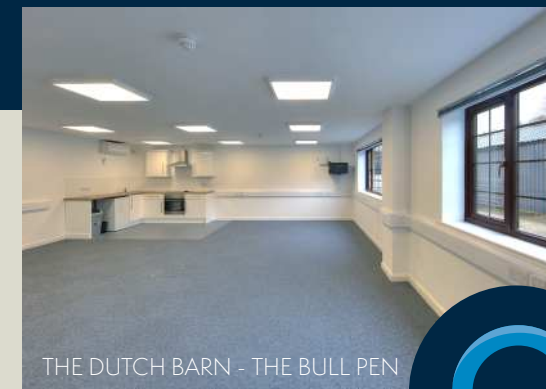
THE DUTCH BARN - THE BULL PEN