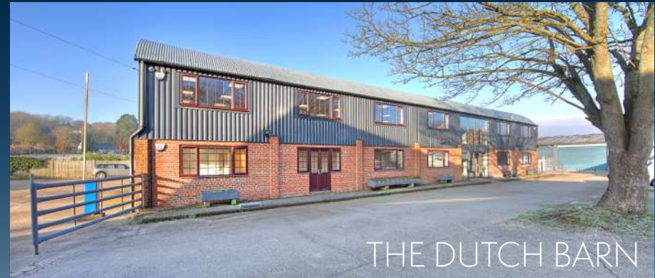
THE DUTCH BARN