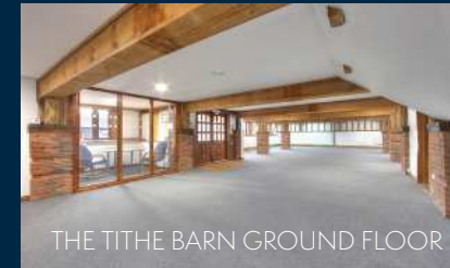
THE TITHE BARN GROUND FLOOR