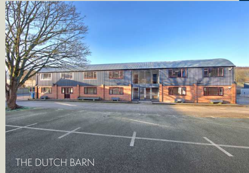
THE DUTCH BARN

The Dutch Barn and The Tithe Barn are former farm buildings which have been sympathetically converted into high quality office space.