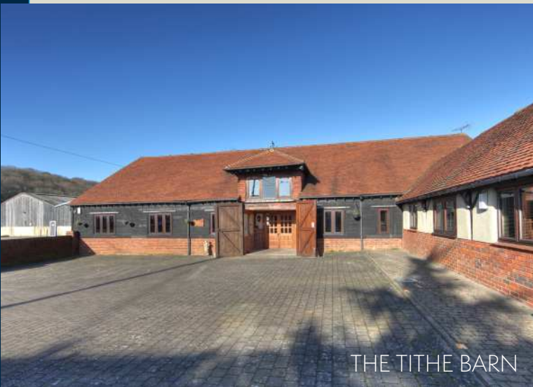
THE TITHE BARN

The Dutch Barn is of brick and metal clad elevations beneath a barrel metal roof. The accommodation is split into two wings on each floor, accessed via a central galleried entrance lobby/staircase providing WCs on each floor and shower facilities.