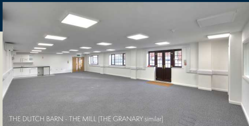
THE DUTCH BARN - THE MILL (THE GRANARY similar)