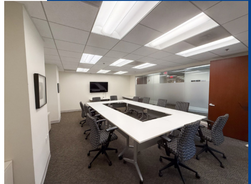
Large conference room