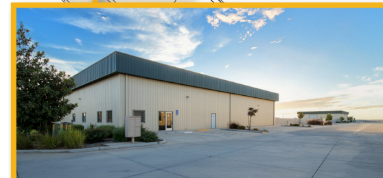
4832 Rosedale Lane