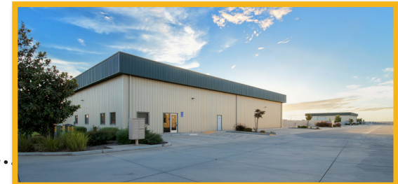
4832 Rosedale Lane