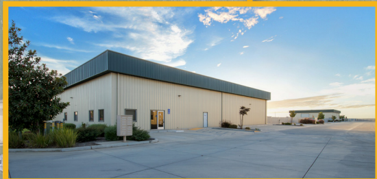
4832 Rosedale Lane

4832 Rosedale Lane Bakersfield, CA 93317