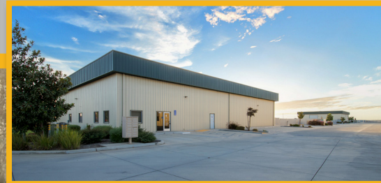
4832 Rosedale Lane

4832 Rosedale Lane Bakersfield, CA 93317