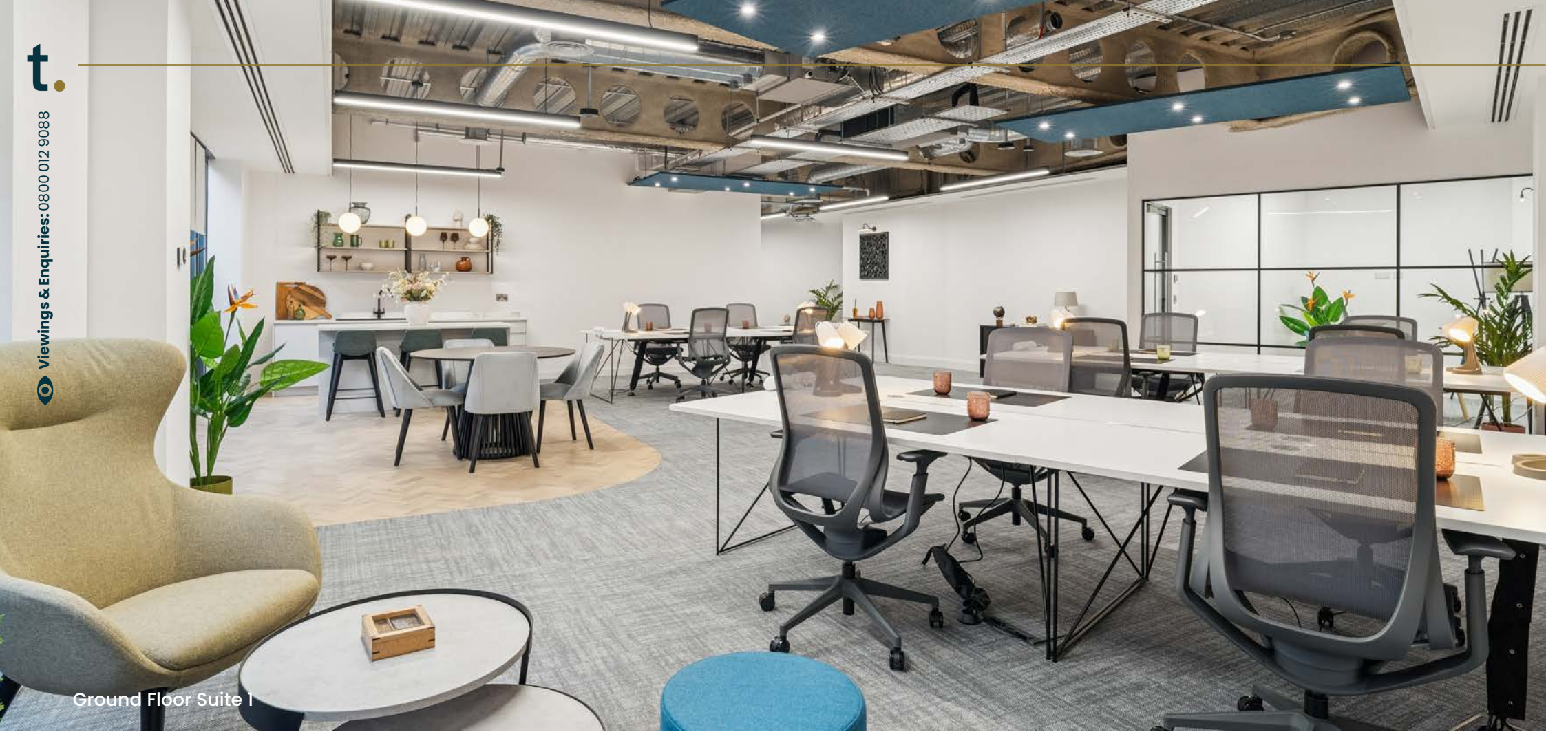
Ground Floor Suite 1