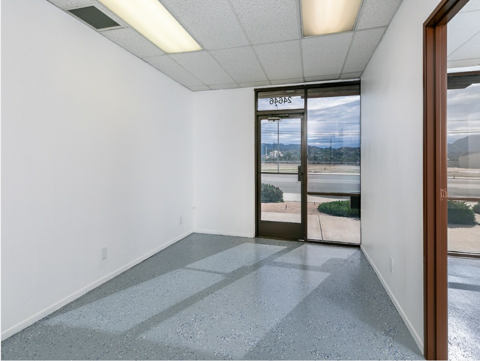
24646 Redlands Blvd-11