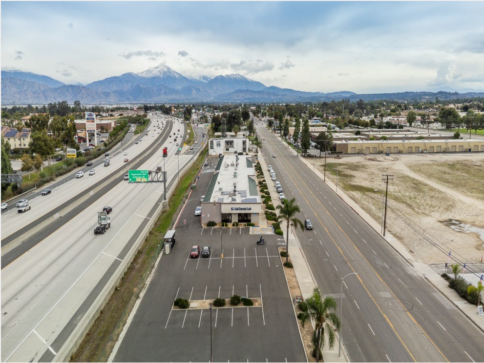
24646 Redlands Blvd Drone-3