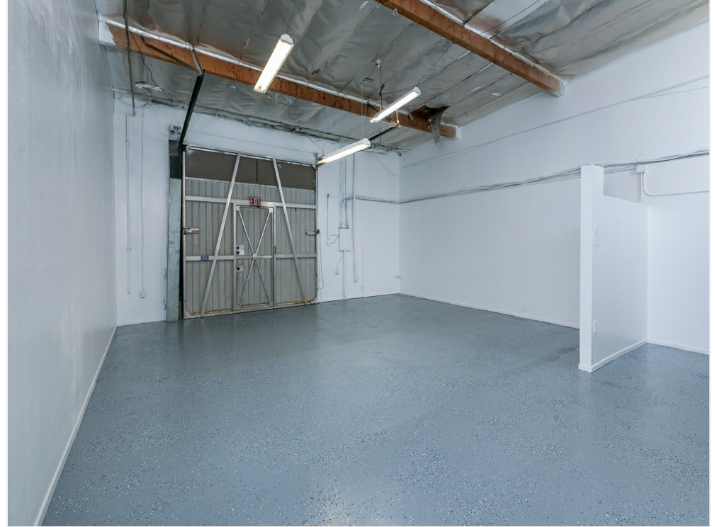
24646 Redlands Blvd-29