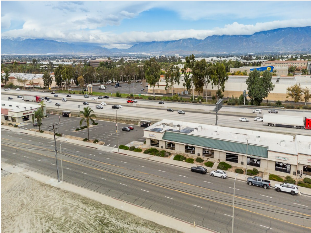
24646 Redlands Blvd Drone-2