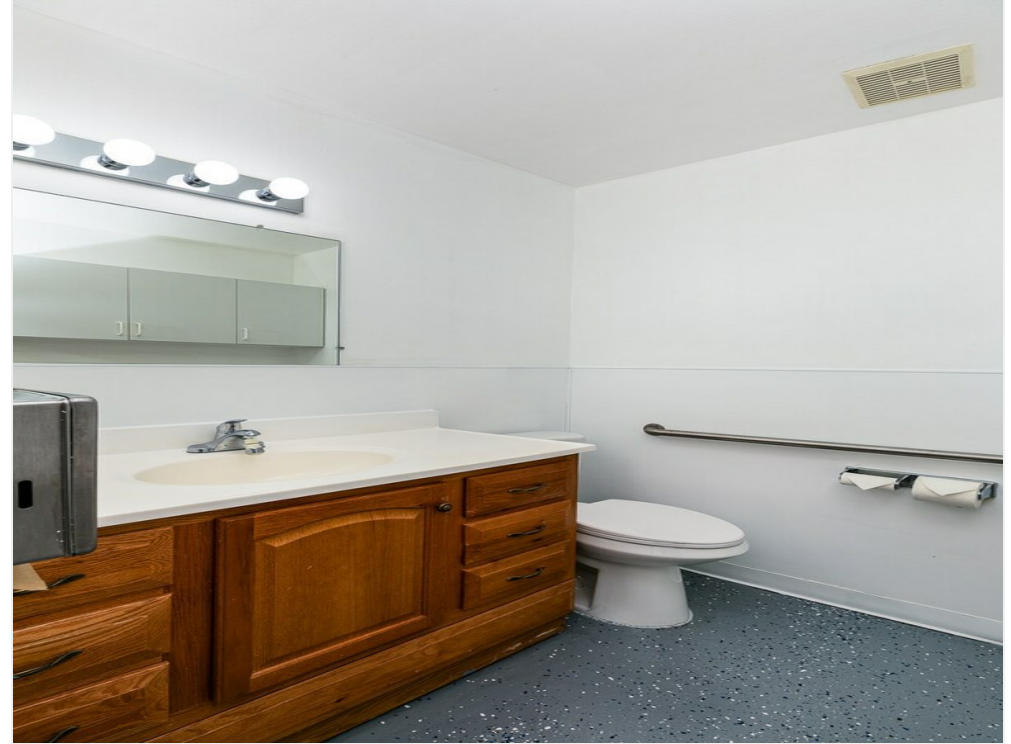
24646 Redlands Blvd-23