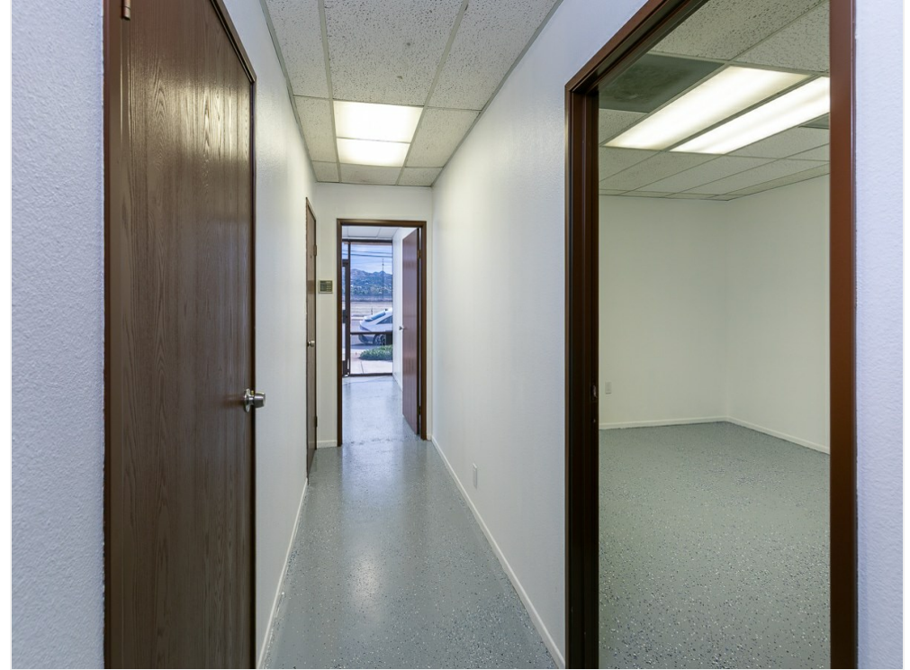
24646 Redlands Blvd-19