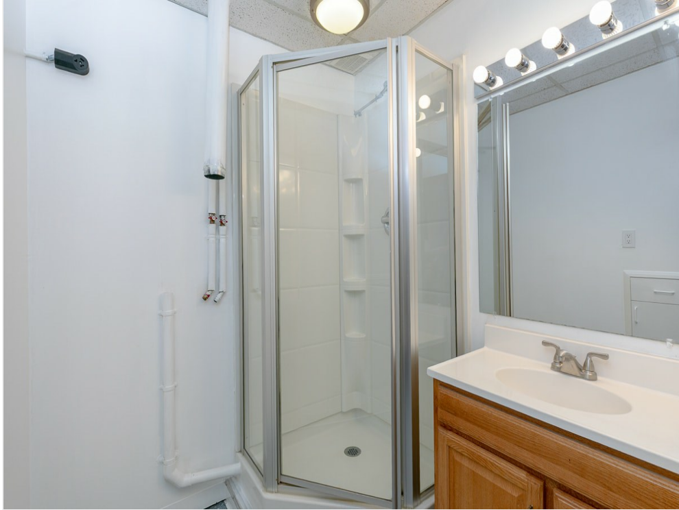
24646 Redlands Blvd-20