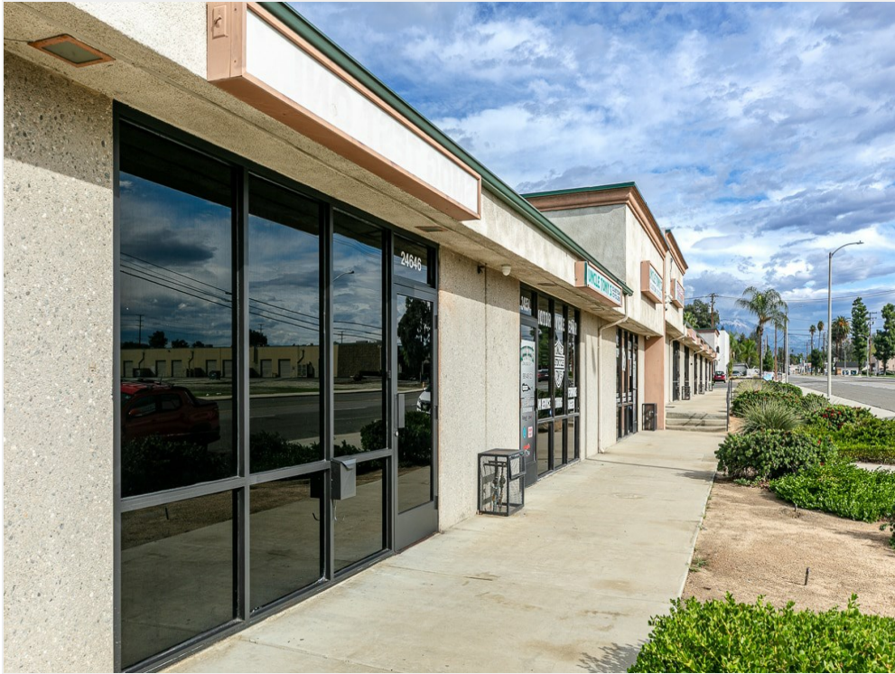
24646 Redlands Blvd-7