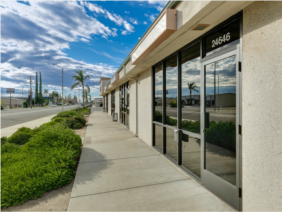
24646 Redlands Blvd-9