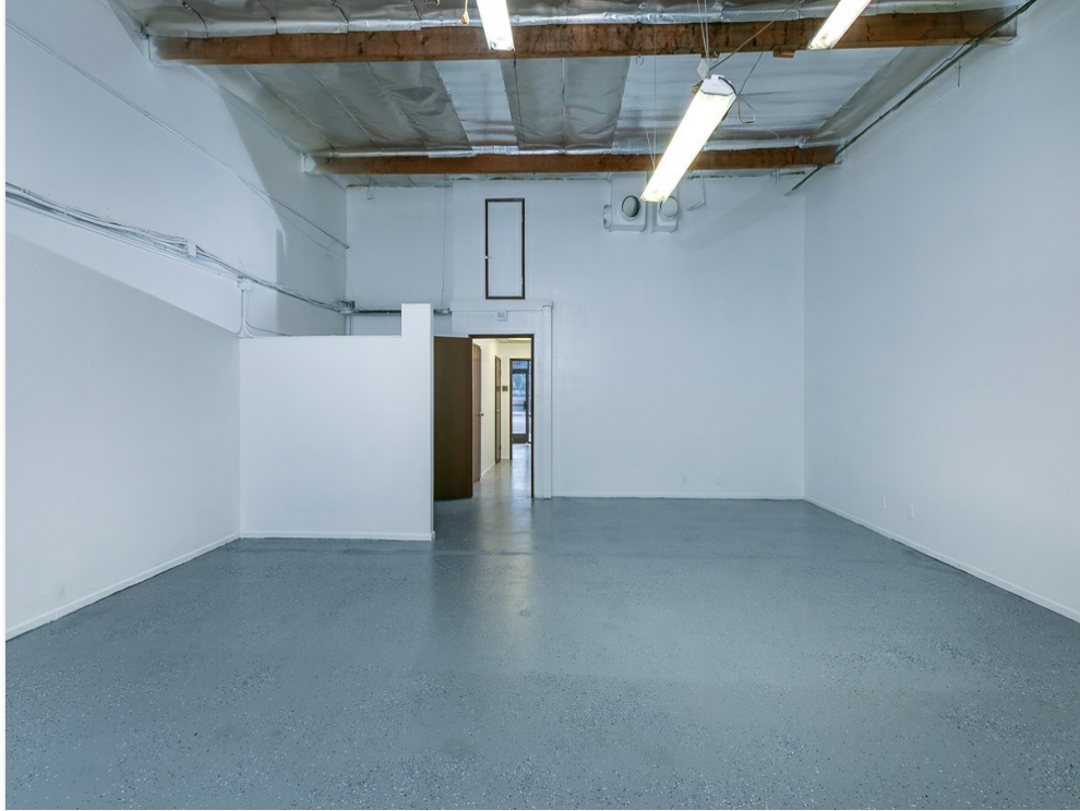
24646 Redlands Blvd-25