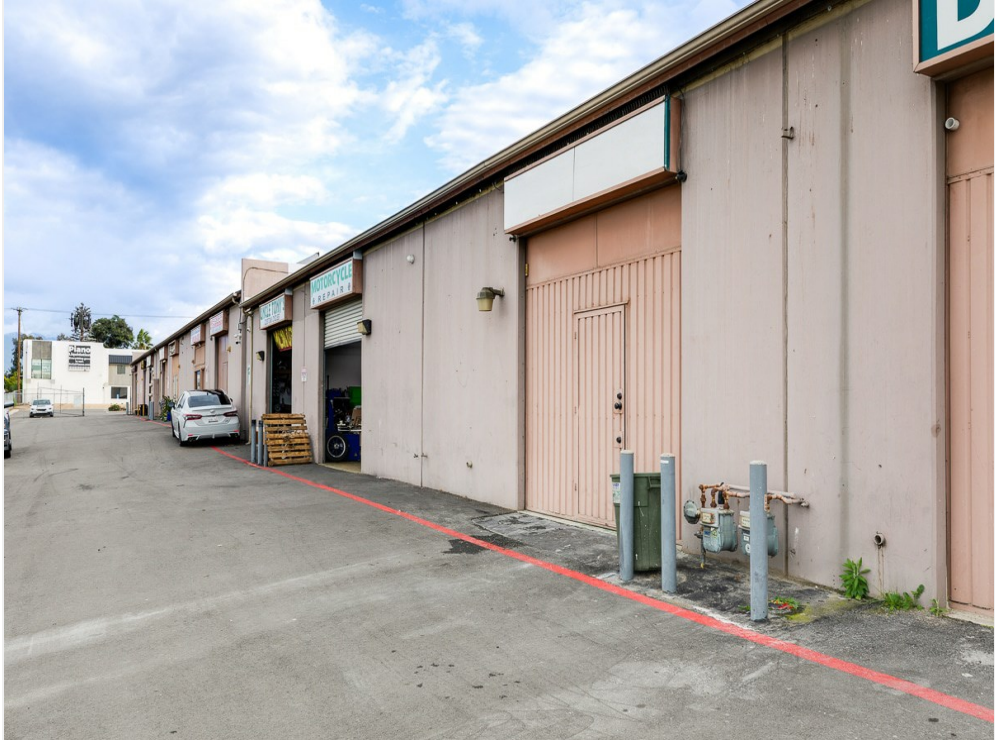
24646 Redlands Blvd-32