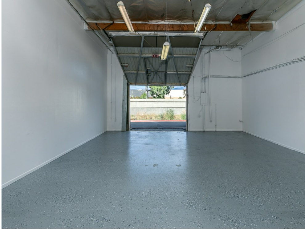
24646 Redlands Blvd-31