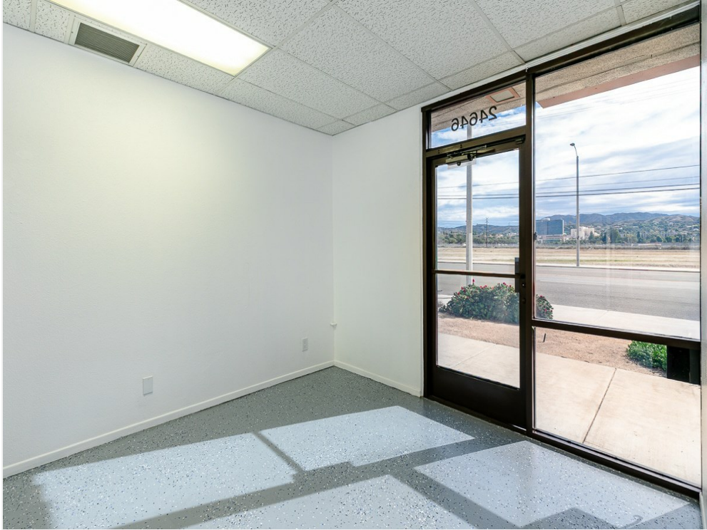
24646 Redlands Blvd-10