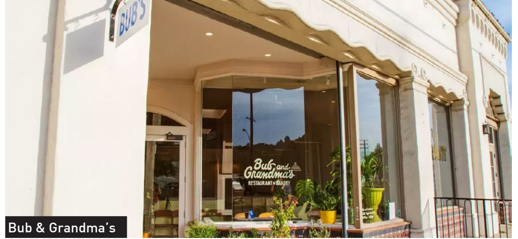
Bub & Grandma's