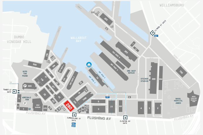
BLDG 280 LOCATION