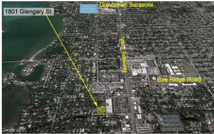
Macro Aerial View