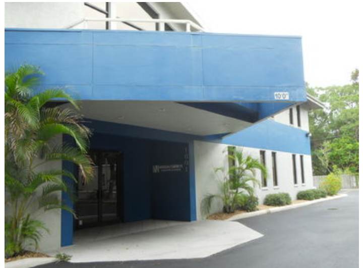
Glengary Exterior Entry