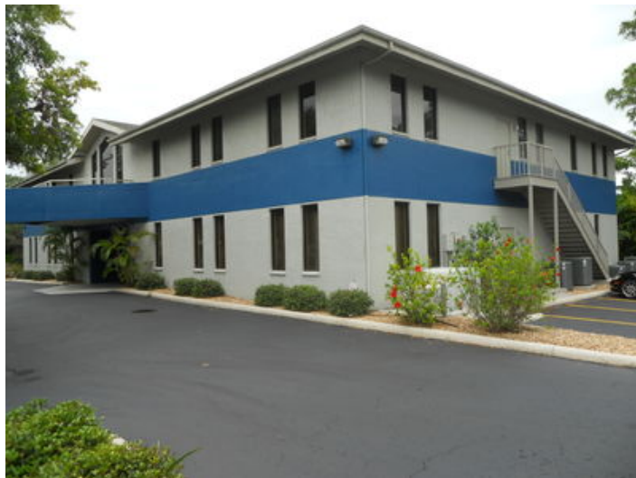
Glengary Exterior 2