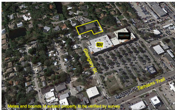
Immediate Area View