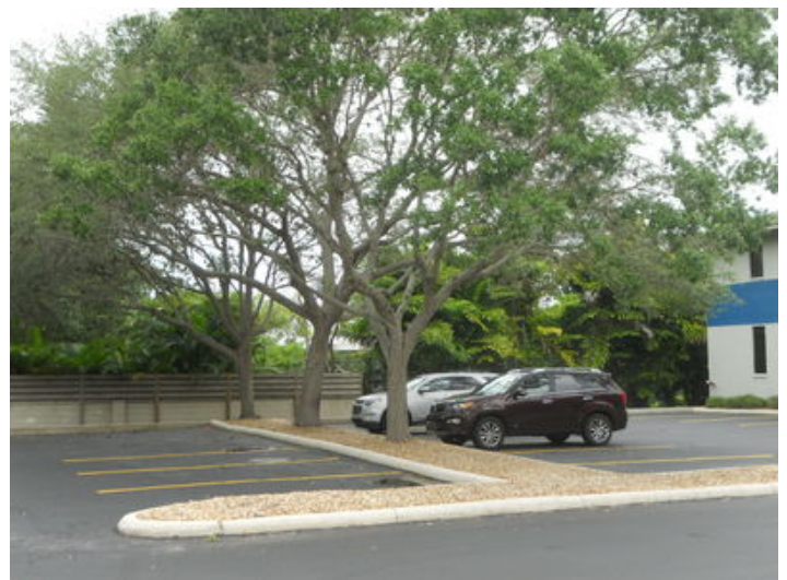
Sample Glengary Parking