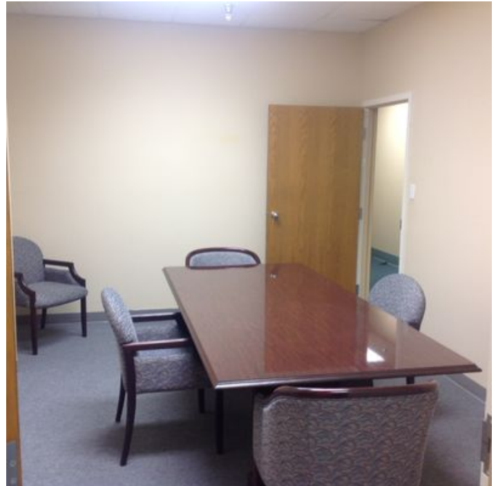
Sample Conference Room