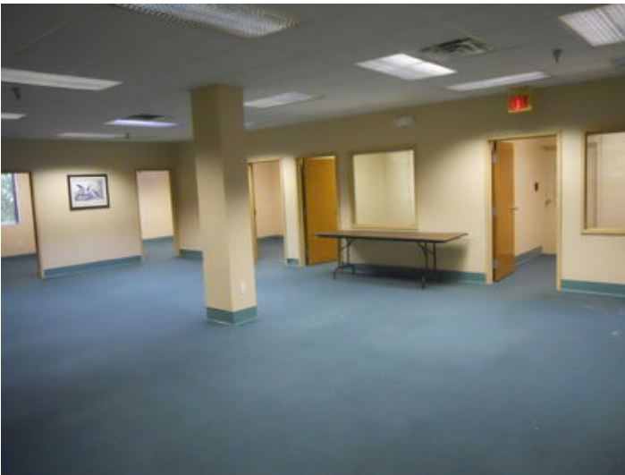
Large Open Work Area