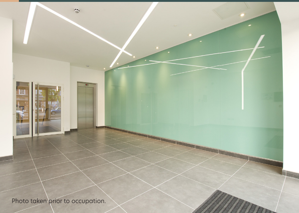
Photo taken prior to occupation.