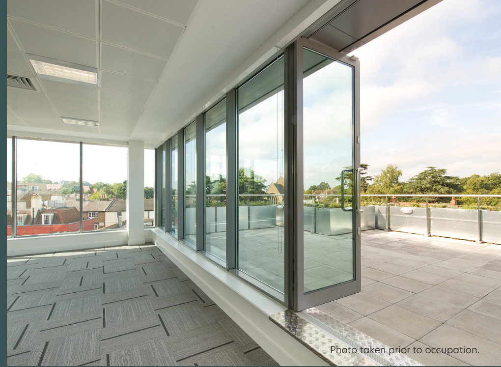
Photo taken prior to occupation.

There are male and female toilets on each floor fitted to a high standard along with disabled WC's/shower rooms. The building has its own secure car park at first floor level approached via an electric roller shutter door from the High Street, there are also some covered cycle bays in this car park.