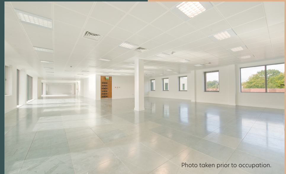
Photo taken prior to occupation.