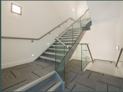
Photos taken prior to occupation.