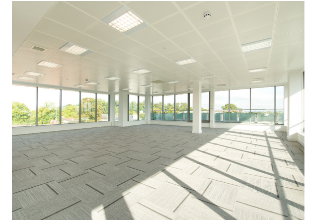
Photos taken prior to occupation.