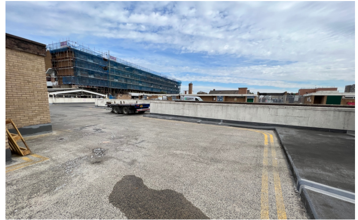
Above (left) door to/from first floor storage to loading area. (right) loading area.