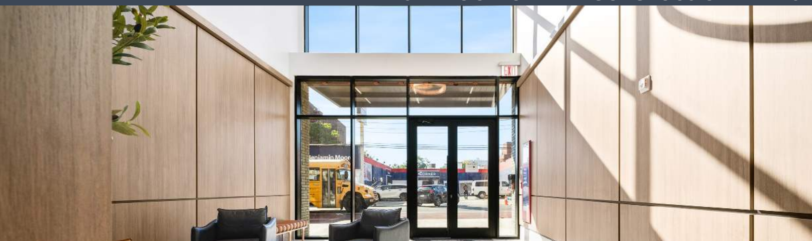
LUXURY MODERN LOBBY WITH OVERSIZED WINDOWS