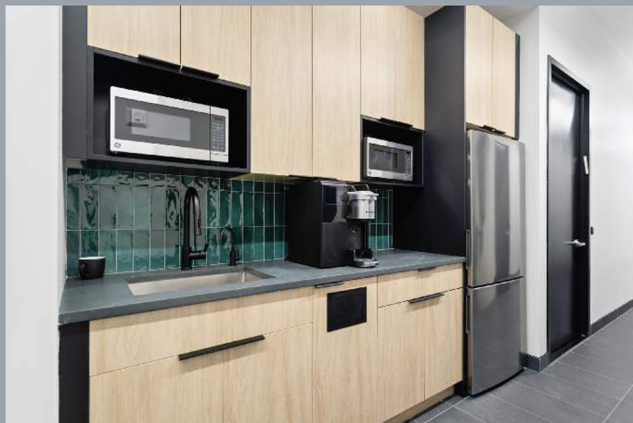
luxury shared kitchenette where connections are created