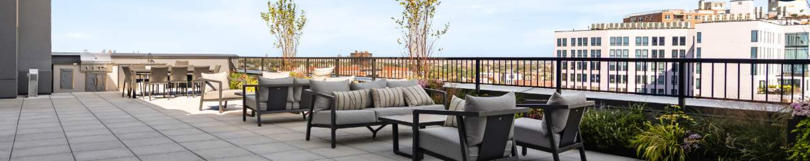
EXPANSIVE ROOFTOP WITH GORGEOUS CITY VIEWS