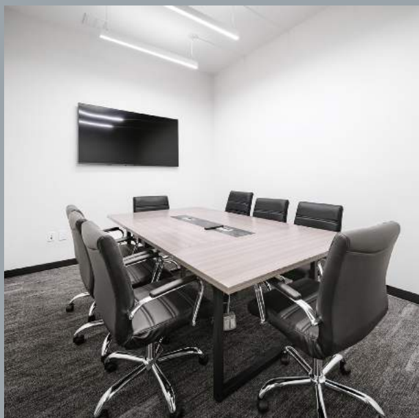
shared conference room where your team can thrive