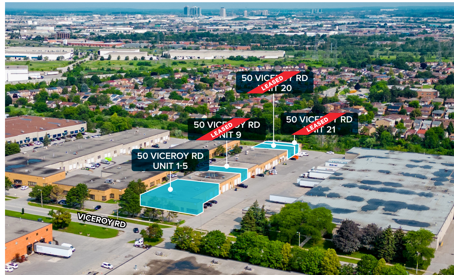
*Outlines are approximate