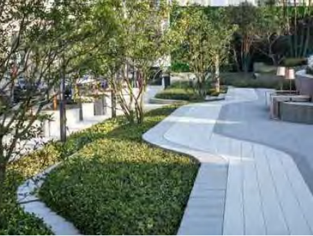
CURVED CORNER DETAILS