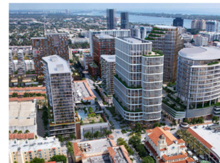
Rendering showing the proposed West Tower, center and East Tower, right, in the Related Compo development in downtown West Palm Beach called The Square.

Pair of 15-Story Towers Measuring Just Over 1 Million Square Feet of the Square Mixed-Use Complex