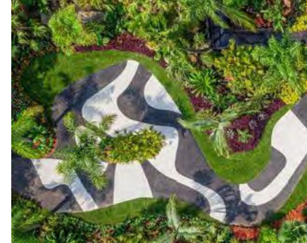
BURLE MARX INSPIRED SHAPES AND PATTERNS IN HARDSCAPE