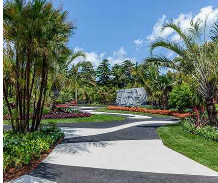
MEANDERING PATHS THROUGH LANDSCAPE