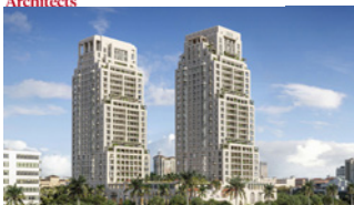
SOUTH FLAGLER HOUSE

The First Luxury Residential High-Rise in Florida Designed by World Renowned Architecture Firm Robert A.M. Stern Architects