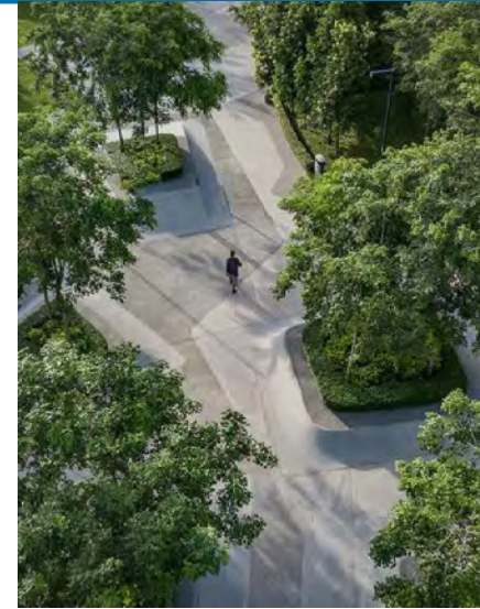
CONCEPT IMAGE- RAISED PLANTERS WITH INFORMAL SEATING