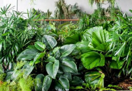
LUSH, LEAFY, TOPICAL PLANT PALETTE THAT GROWS IN SHADE