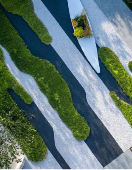
CONCEPT IMAGE- GEOMETRIC PAVING PATTERN AND PLANTERS