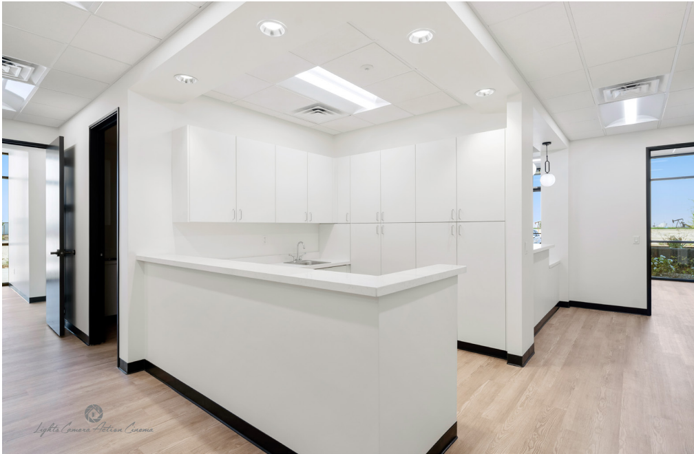
*Model Suite Photos of 11901 Bolthouse Dr