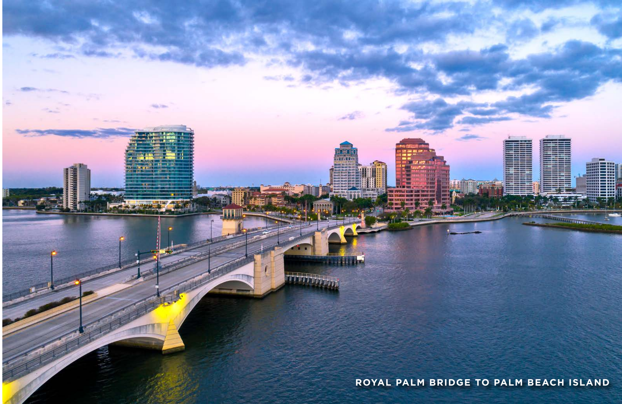
ROYAL PALM BRIDGE TO PALM BEACH ISLAND