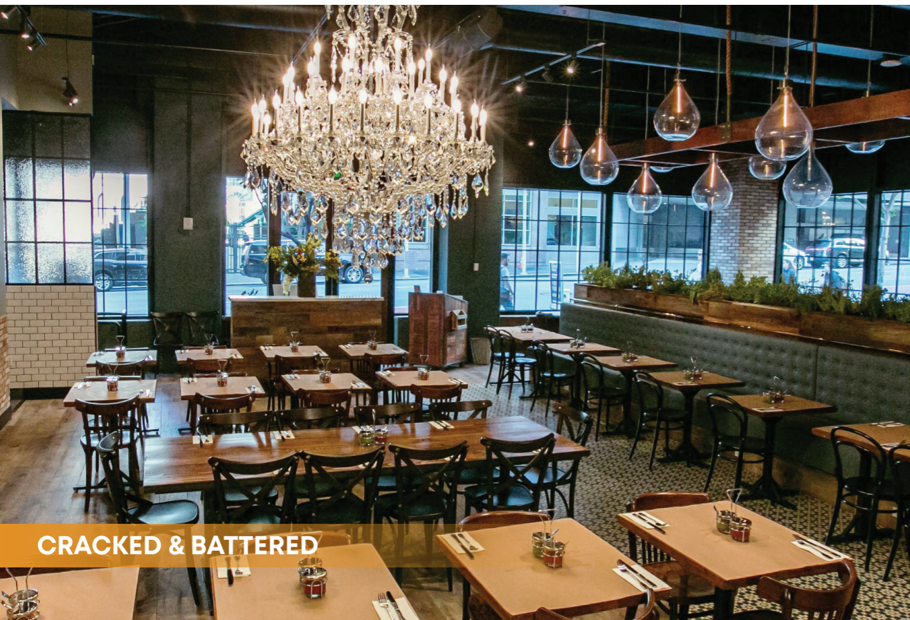
CRACKED & BATTERED