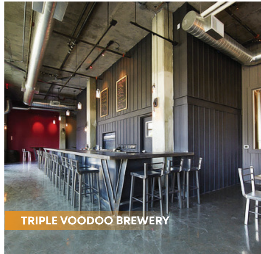
TRIPLE VOODOO BREWERY