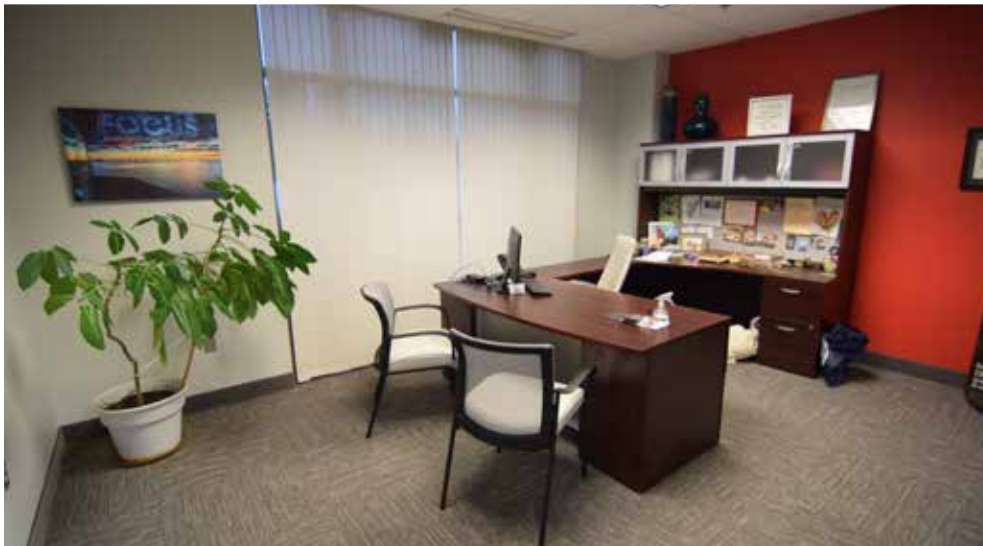
Suite 130 - 1st Floor - 1,496± RSF