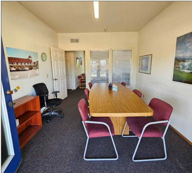
Common Area Conference