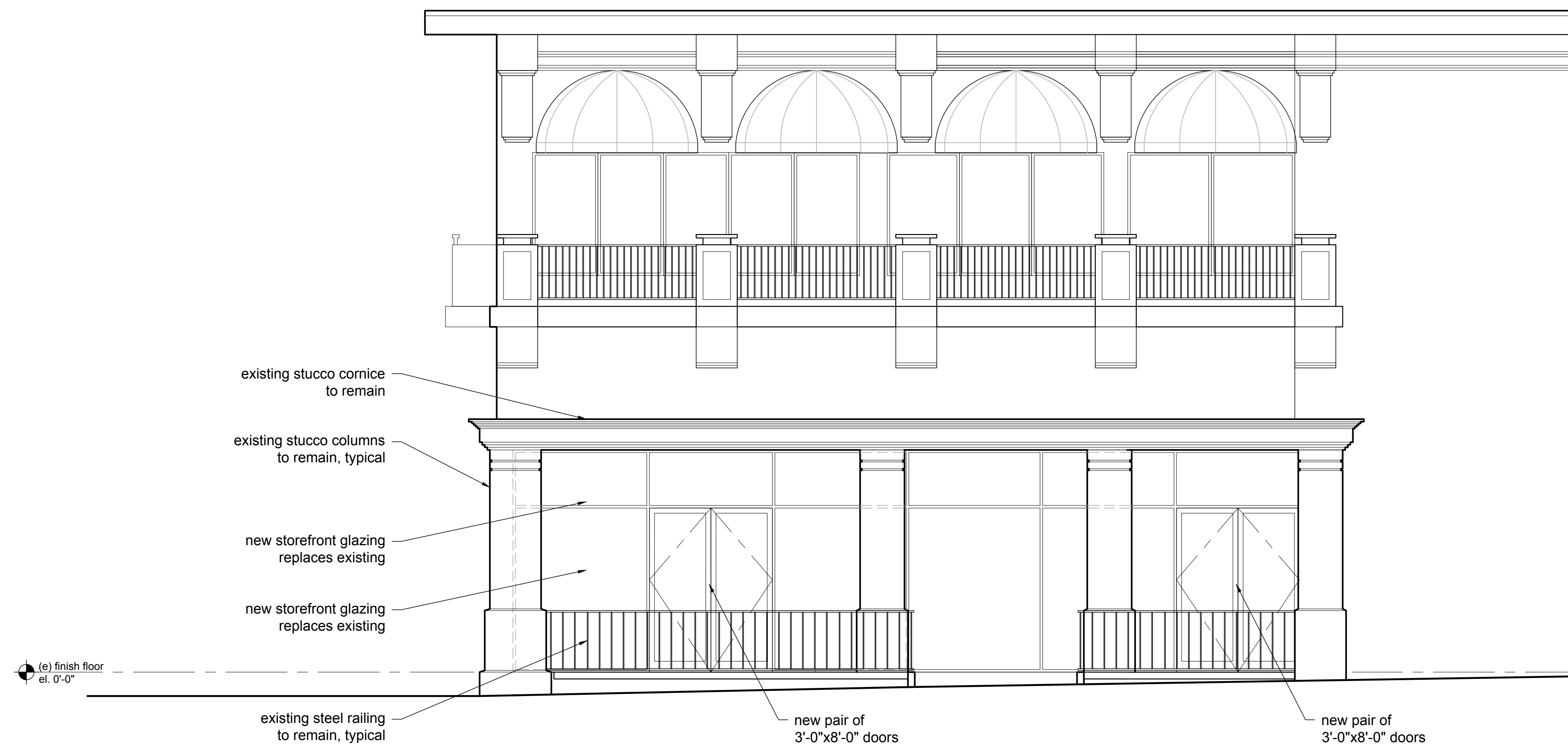
proposed elevation east \frac{1}{4}''=1'-0''