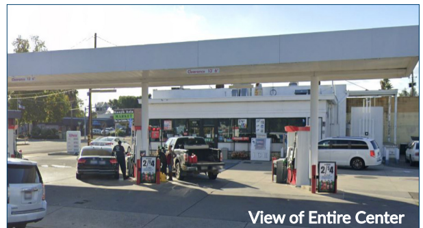
View of Entire Center