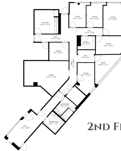
2ND FLOOR SUITE