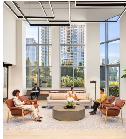
VENUE MEETINGS & EVENTS