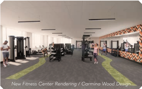
New Fitness Center Rendering / Carmina Wood Design