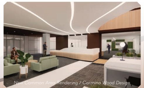
New Common Area Rendering / Carmina Wood Design

As the property transitions to include leasing opportunities for multiple tenants, the future of the property will bring redesigned common areas and upgraded fitness center and food service amenities with a hospitality feel in mind.