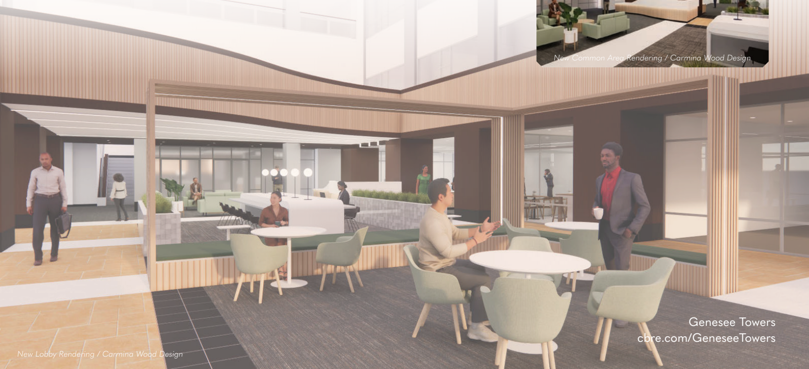
New Lobby Rendering / Carmina Wood Design