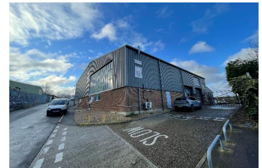
Photos are indicative of a past refurbishment of the unit.