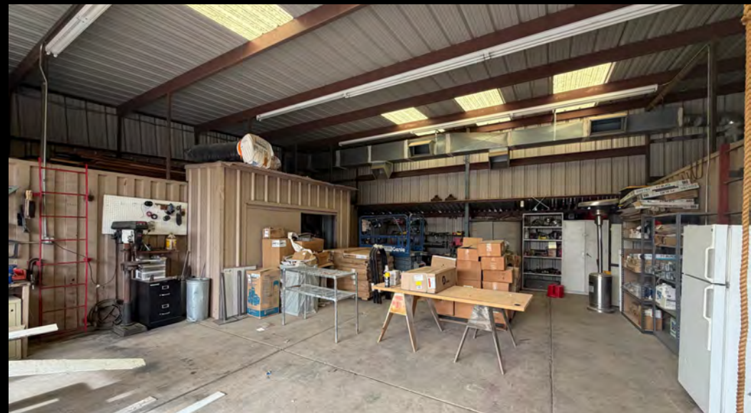
Warehouse - 13' Clear