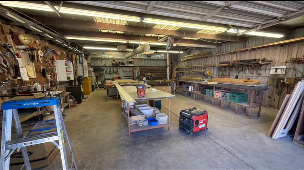
Workshop - 10' Clear