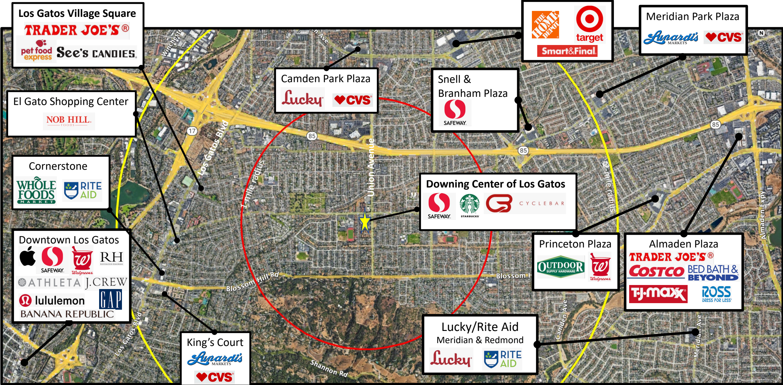
Downing Center Market Aerial