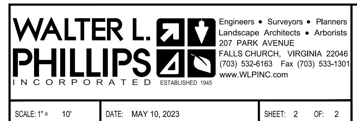
EXHIBIT SHOWING UNIT AREA THE PROPERTY OF 2400 COLUMBIA PIKE, LLC ARLINGTON COUNTY, VIRGINIA