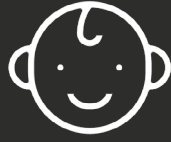
On-site Day Care