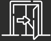
2 Patient Drop-off Locations